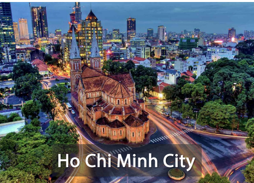
Ho Chi Minh City